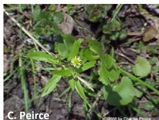
Kidney leaf buttercup basal leaves (left); whole plant (right)

Henbit ( Lamium purpureum ) and creeping charlie ( Glechoma hederacea ) have similar shaped leaves, but they are typically smaller with opposite leaves and square stems. Henbit leaves are usually more pointed or triangular while creeping charlie leaves have more broadly rounded, larger teeth. Large creeping charlie leaves closely mimic garlic mustard—check for the creeping stem. Unlike garlic mustard, neither of these species send up tall flowering stalks and their flowers are purple and irregular.