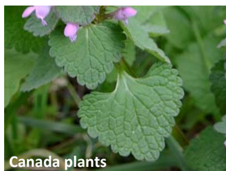
Henbit ( Lamium purpureum )